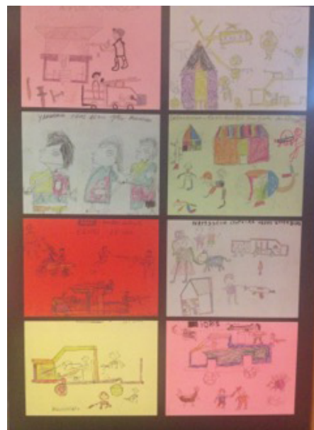
Picture of children's drawings, UNICEF HQ, New York