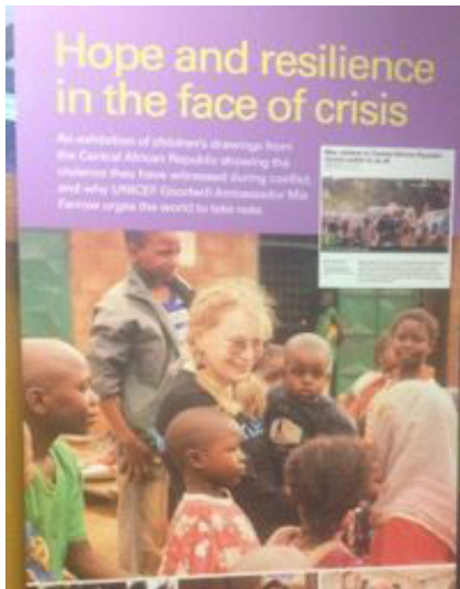
Poster displayed at the entrance of UNICEF's building, UNICEF HQ, New York

and after conflict. In the best scenario, education is perceived as part of longer-term development strategy, but often still left out of more immediate humanitarian responses.